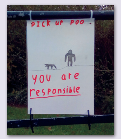
Pictured above: Poster created by 1st Priorslee & St Georges Scouts

Sadly the problem of dog fouling continues to be an issue within the parish. Whilst there are a great many responsible dog owners there still some people who don't pick up their dog's mess despite the health and environmental consequences. The Parish Council recently organised for Priorslee and St Georges Scouts to have a visit from the Dog Warden to learn about responsible dog ownership. They were inspired to produce some really eye catching posters encouraging owners to clear up after their dogs and these posters are displayed on the Parish Council notice boards and other spots within the parish. The Parish Council has free dog poo bags at the Parish Office in Grove St for anyone needing them.