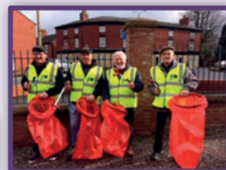
Councillors and Volunteers carried out a Litter Pick Event