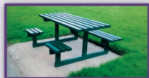
Installation of New Picnic Benches on Priorslee Village Green